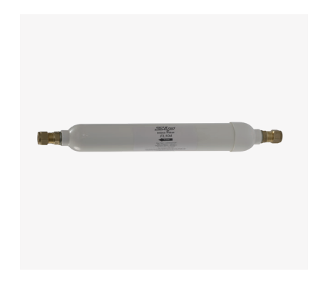
Inline filter FL104

Allowing the contactless delivery of boiling water for the EconoBoil and HydroBoil.