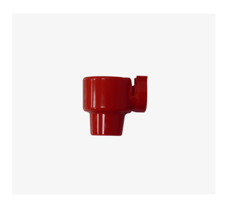
Insulating tap body cover 94514

Prevents boiling water being dispensed accidentally. To dispense, a lever on the back of the handle needs to be released.