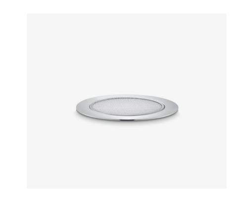
Standalone font 93441UK

10" filter for taste and odour removal with limescale reduction. For use with HydroBoil 10 litre models and above.