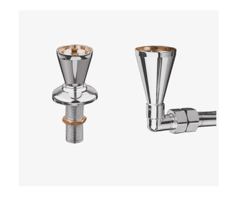
Tundish ZD100 Wall mounted, chromed. ZD101 Sink mounted, chromed.

Bright chrome (with drain adaptor). Ø176 font outline.