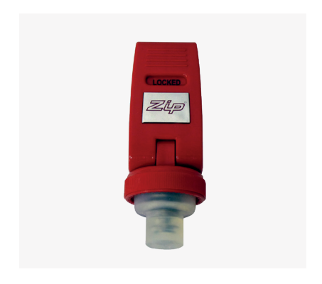
Safety tap top assembly 93734

Prevents boiling water being dispensed accidentally. To dispense, a lever on the back of the handle needs to be released.