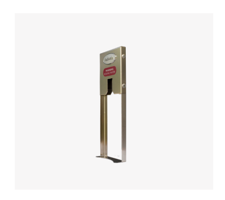
Touch free adaptor XTPA/1

6" filter for taste and odour removal with limescale reduction. For use with HydroBoil up to 7.5 litre models.