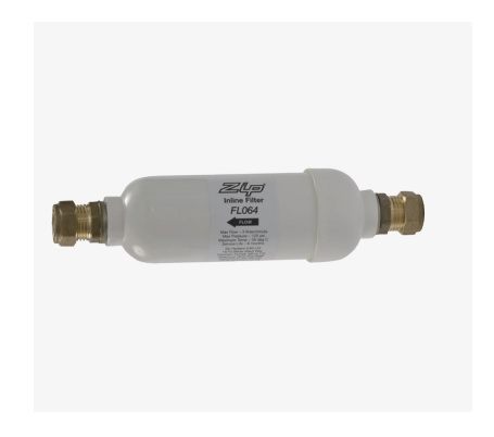
Inline filter FL064

For EconoBoil and HydroBoil. A heat cover for exposed tap outlets preventing the user from any accidental burns.